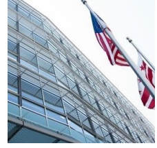
Case Note: Arbitration