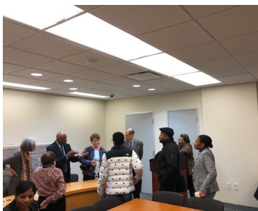
Group Discussion with Board