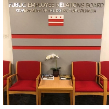
Virtual Board Meetings