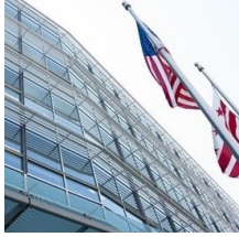
PERB Operating Status